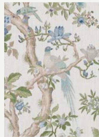
ELTHAM – BLUE BP10948/1