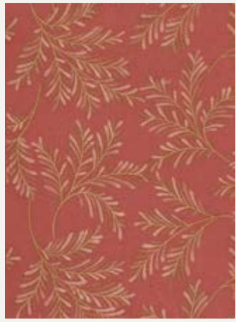
CHELSEA FERN – RED BF10945/450

Inspired by the delightful English countryside during the spring and summer months and stunning documents from the GP & J Baker the colour palette ranges from soft, modern shades of parchment, blush and sage to fresh leaf greens and soothing blues, perfectly suited