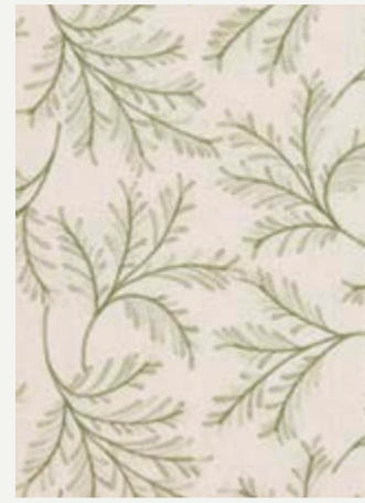
CHELSEA FERN – GREEN BF10945/735