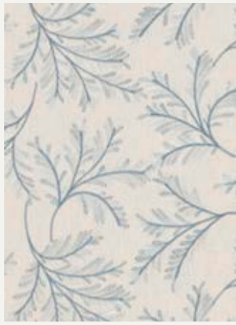
CHELSEA FERN – BLUE BF10945/660