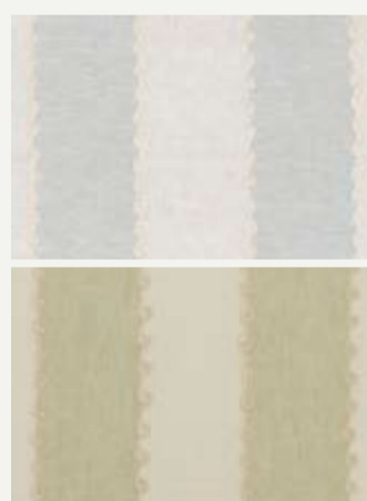
ASHMORE STRIPE AQUA BF10944/725 GREEN BF10944/735