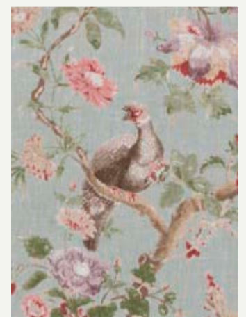
BROUGHTON ROSE – AQUA BP10949/4