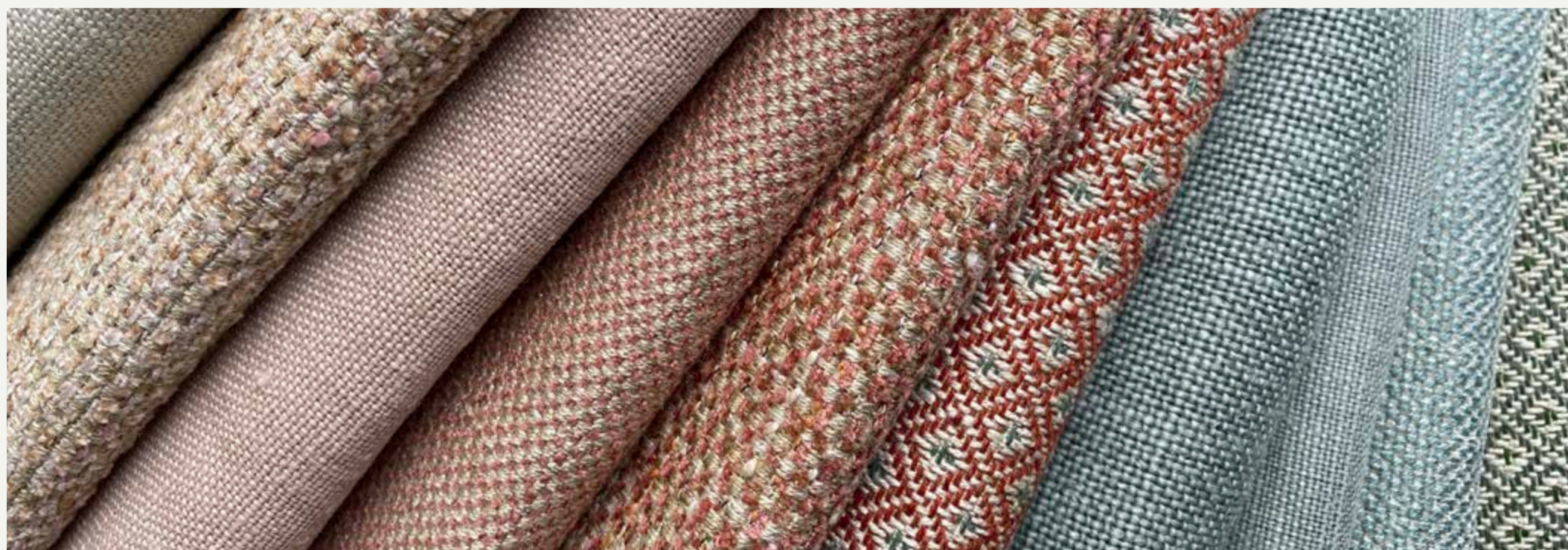
ABOVE (LEFT TO RIGHT): BAKER HOUSE LINEN - PARCHMENT, PENTRIDGE - SHELL, BAKER HOUSE LINEN - BLUSH, DARWEN - BLUSH, PENTRIDGE - TOMATO, MORLEY - TOMATO, WEATHERED LINEN - TEAL, HOUSE LINEN - SEA FOAM, DARWEN - SOFT TEAL, MORLEY - TEAL. FRONT COVER: CURTAINS IN ELTHAM - RED, CHAIRS IN HOUSE LINEN - PEBBLE. BACK COVER (LEFT TO RIGHT): ASHMORE STRIPE - RED, CHATTO - GREEN, SUMMER PEONY - RED, CHELSEA FERN - GREEN

Our 'House' fabrics include the ever popular 'House Velvet' which is joined by the new 'House Linens', two brilliant linen fabrics in a wide range of colours and 'House Textures', a fabulous range of five textures in varying weights and weaves.