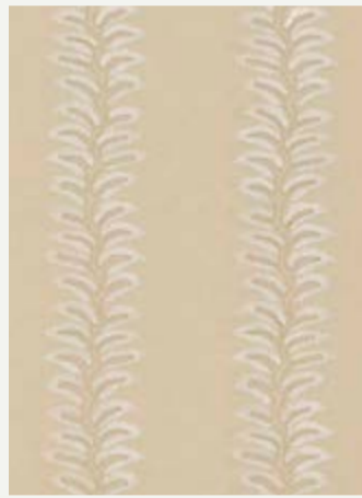
NEW BRADBOURNE – CREAM BF10946/120