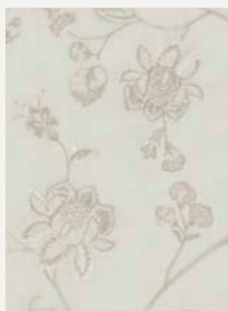
ISABELLA SHEER - IVORY BV10953/104