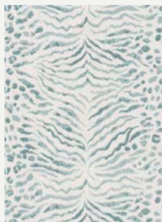
CHATTO - AQUA BP10952/725