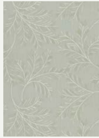
CHELSEA FERN – AQUA BF10945/725