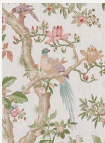
ELTHAM – ANTIQUE BP10948/3