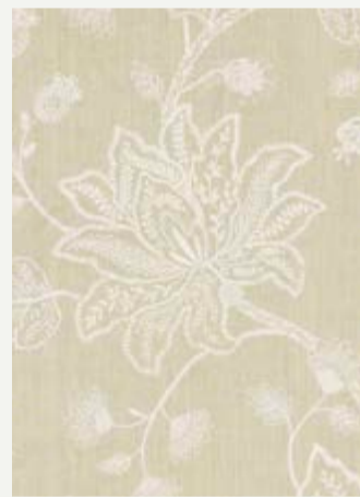
DUNHAM – GREEN BF10947/735