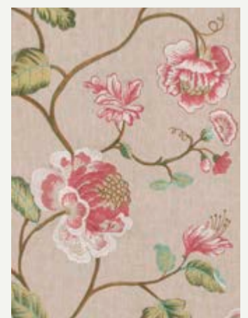
LAVENHAM – ROSE BF10951/2