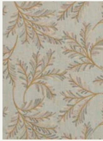
CHELSEA FERN – AQUA/ BRONZE BF10945/715