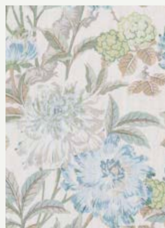
SUMMER PEONY – AQUA BP10950/4