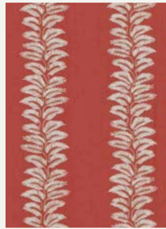
NEW BRADBOURNE – CORAL BF10946/310