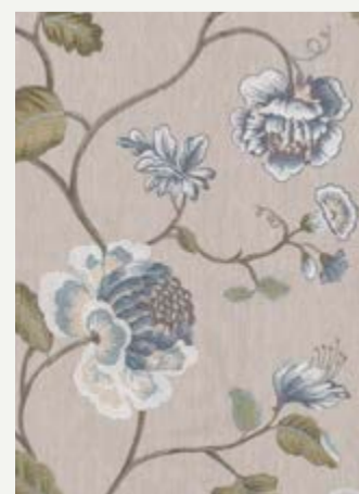
LAVENHAM – BLUE BF10951/1