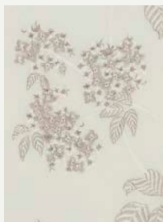
HYDRANGEA SHEER - IVORY BV10954/104