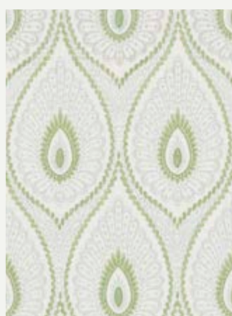
ASHMORE - AQUA/GREEN BF10955/6