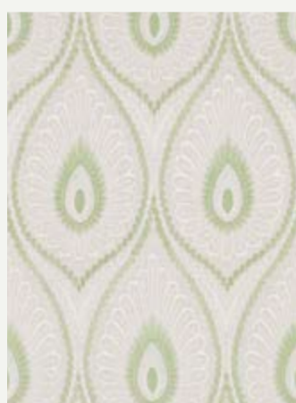
ASHMORE - SPRING GREEN BF10955/5