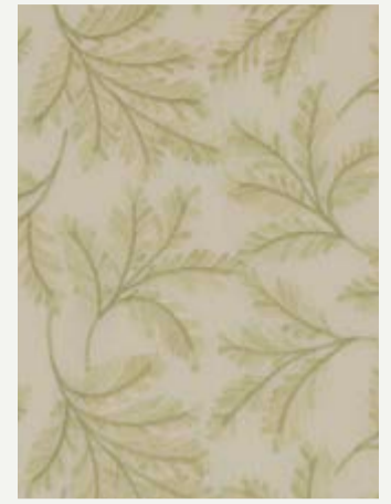
CHELSEA FERN – SPRING GREEN BF10945/760