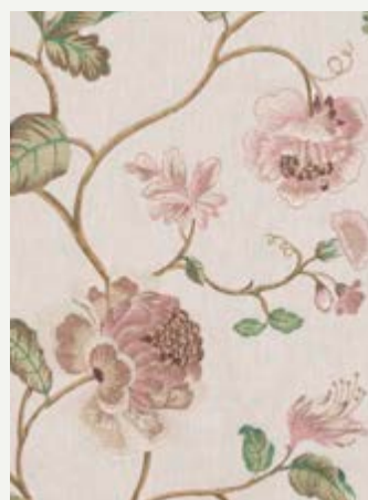
LAVENHAM - ANTIQUE BF10951/3

archive, the Ashmore fabric collection features prints and embroideries of painterly birds and delicate florals. Timeless and understated, to all styles of interiors.