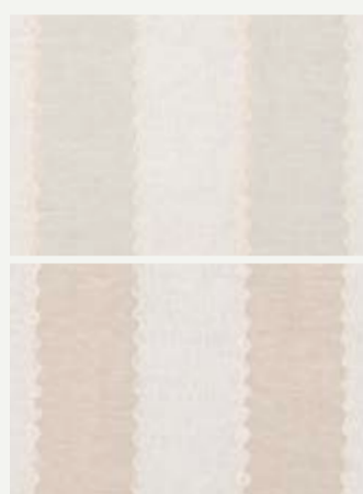
ASHMORE STRIPE LINEN BF10944/110 PARCHMENT BF10944/225