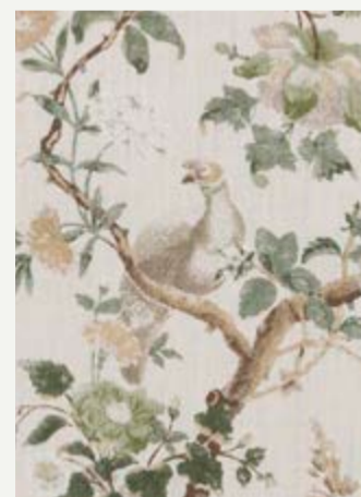
BROUGHTON ROSE – GREEN BP10949/3