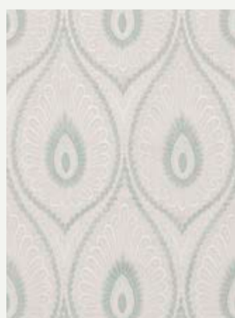
ASHMORE - AQUA BF10955/4