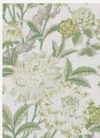
SUMMER PEONY – GREEN BP10950/3