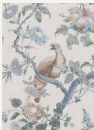
BROUGHTON ROSE – BLUE BP10949/1