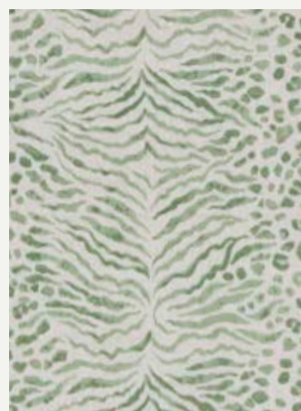
CHATTO - GREEN BP10952/735