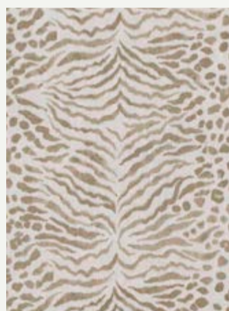
CHATTO - BRONZE BP10952/850