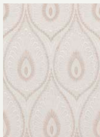
ASHMORE - ANTIQUE BF10955/3