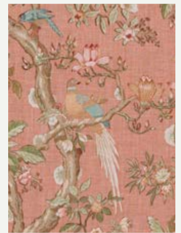
ELTHAM – RED BP10948/2