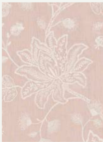
DUNHAM – BLUSH BF10947/440