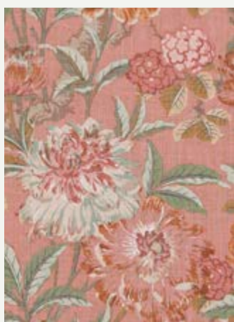
SUMMER PEONY – RED BP10950/2