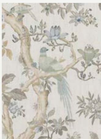
ELTHAM – AQUA BP10948/4