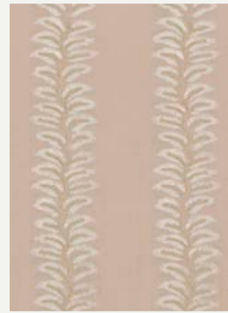
NEW BRADBOURNE – BLUSH BF10946/440