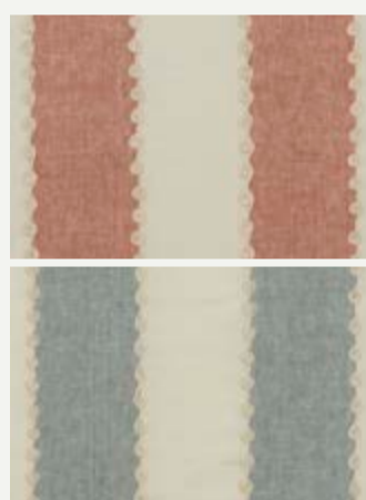
ASHMORE STRIPE RED BF10944/450 BLUE BF10944/660