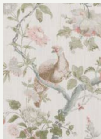
BROUGHTON ROSE – BLUSH BP10949/2