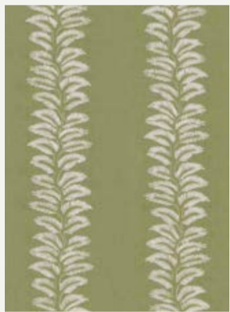
NEW BRADBOURNE – GREEN BF10946/735