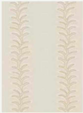
NEW BRADBOURNE – IVORY BF10946/104