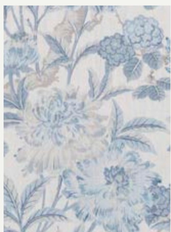
SUMMER PEONY – BLUE BP10950/1