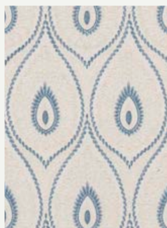
ASHMORE - BLUE BF10955/1