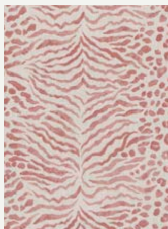
CHATTO - RED BP10952/450