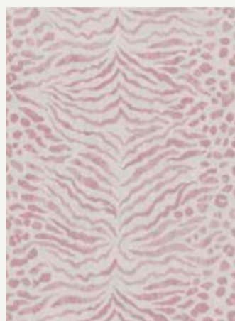
CHATTO - BLUSH BP10952/440