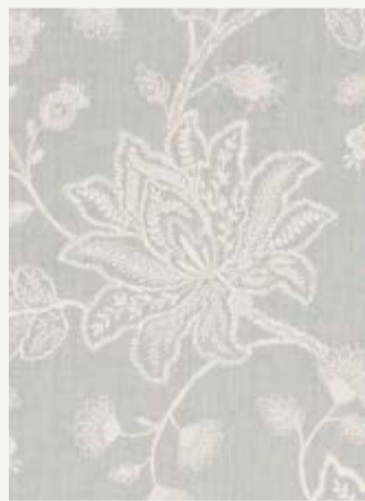
DUNHAM – AQUA BF10947/725