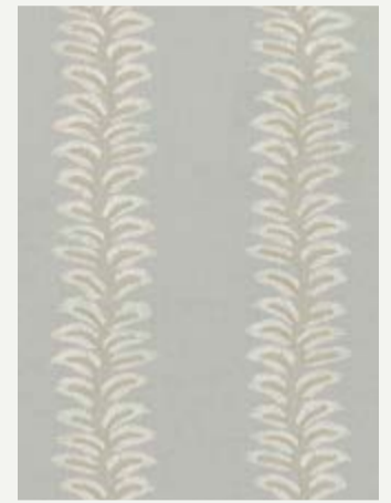
NEW BRADBOURNE – PALE AQUA BF10946/715