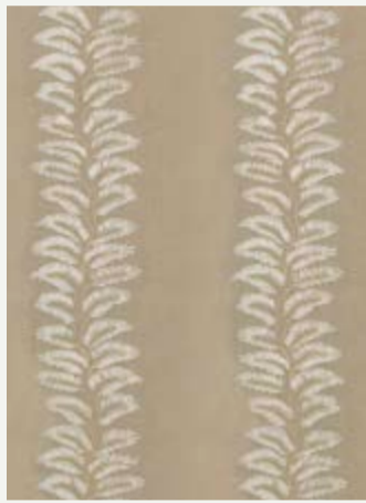
NEW BRADBOURNE – LINEN BF10946/110