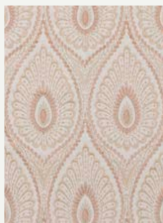
ASHMORE - SHELL BF10955/2