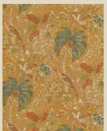
FANTASIA FD308 - 2 COLOURS