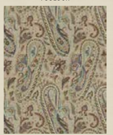
HOXLEY FD302 - 2 COLOURS