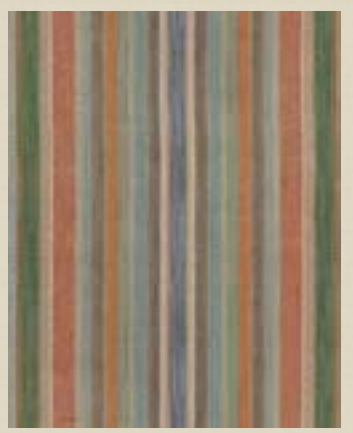
RUSTIC STRIPE FD784 - 2 COLOURS