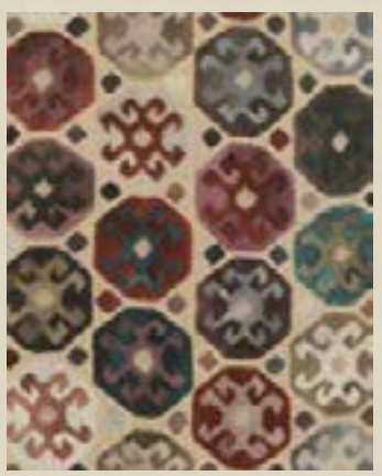
CURIOSITY FD312 - 2 COLOURS