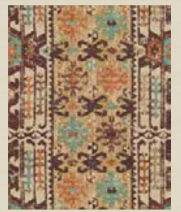
KILVER FD309 - 5 COLOURS