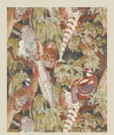
GAME BIRDS FD269 - 1 COLOUR