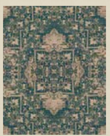
FADED TAPESTRY FD782 3 COLOURS

Front cover Clockwise from left: Ashburn-Indigo, Inside antique bookcase: Claremont-Verdigris, Belmont-Woodsmoke, Adair-Parchment, Walton-Stone, Adlina-Indigo, Fabric length: Wild Side-Teal, Chair: Faded Tapestry-Teal, Cushion: Landscape-Teal/Spice, Length: Fantasia-Teal, Cushion: Walton-Teal & Fairfield Paisley-Soft Teal Back cover Wild Side-Teal