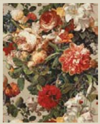
FLORAL POMPADOUR FD301 1 COLOUR