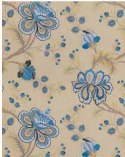
Elvington BF10791 1 colour