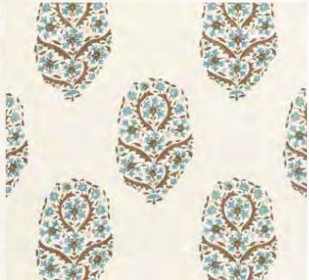
Aydon BP10795 2 colours