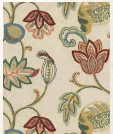
Barbonne BF10790 1 colour