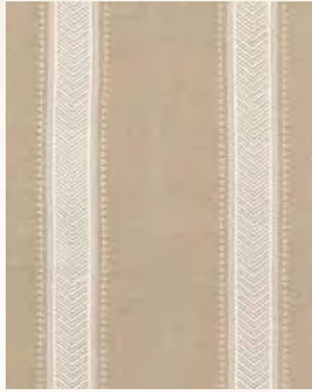
Kerris Stripe BF10799 3 colours