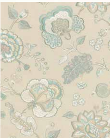
Tresillian BF10797 1 colour