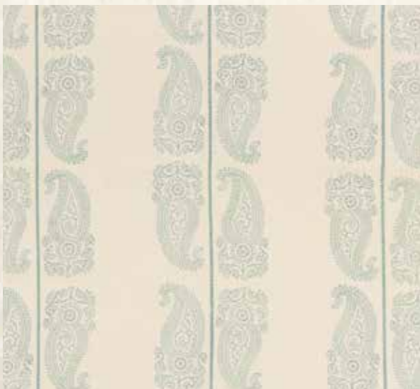
Cromer Paisley BP10796 4 colours