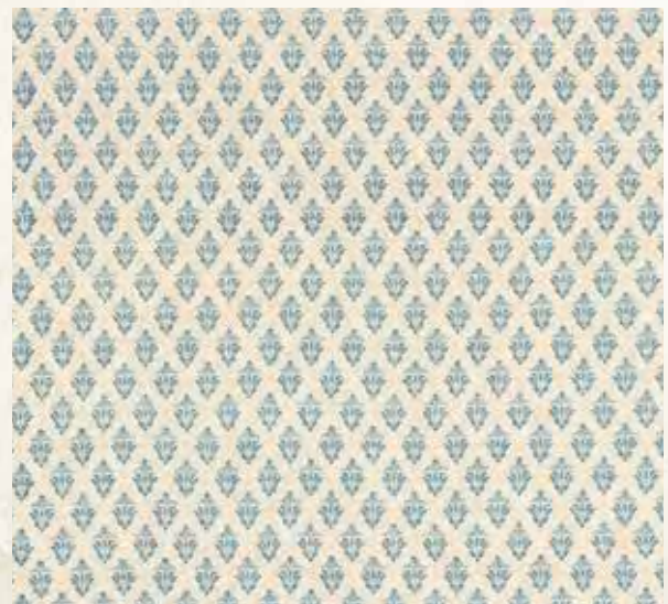
Thornham BP10793 3 colours