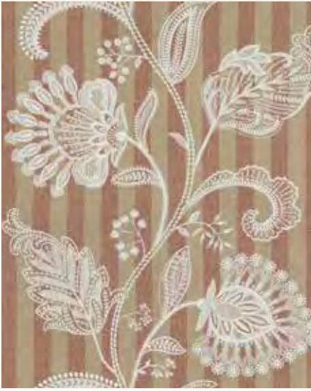
Ellonby BF10764 4 colours