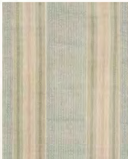
Millbrook BP10794 2 colours