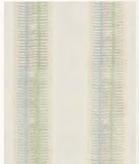
Tamar BF10801 1 colour