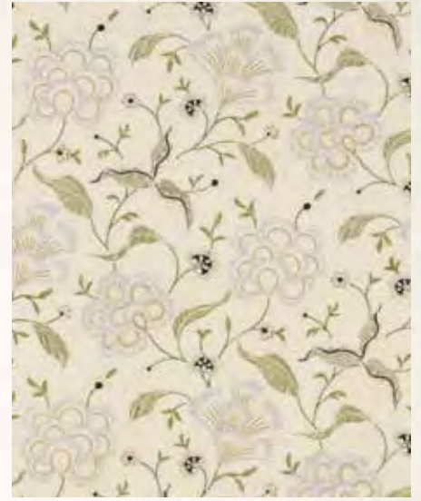
Lamorna BF10798 1 colour