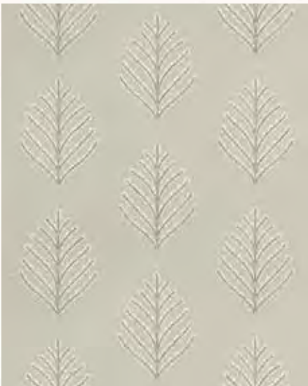
Treen BF10800 3 colours