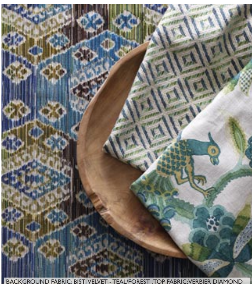
LEAF/TEAL, LOWER FABRIC: LEYLAND PRINT - EMERALD/TEAL