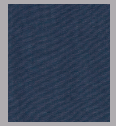
Essential Linen BF10693/680 28 colours