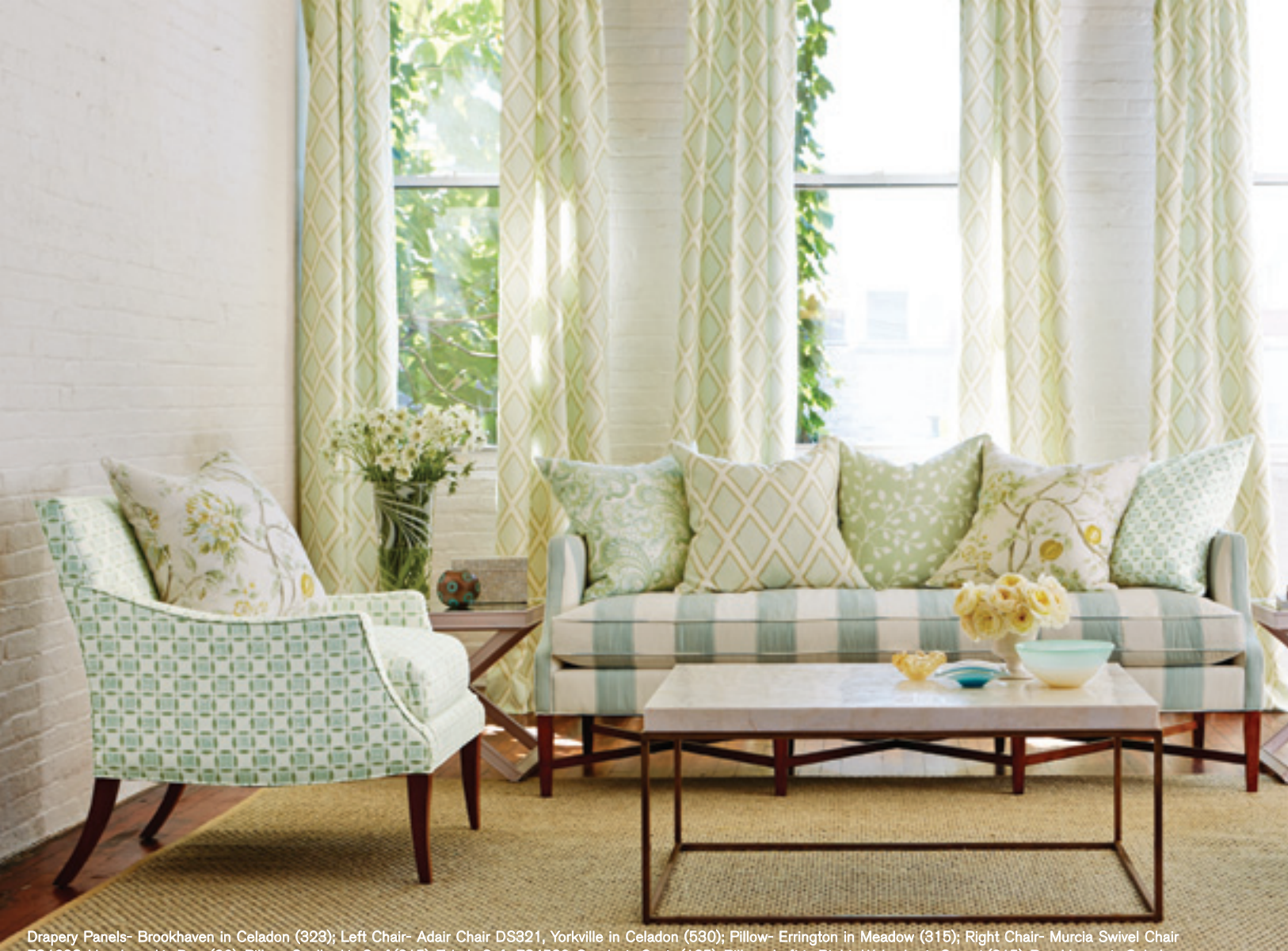
Drapery Panels- Brookhaven in Celadon (323); Left Chair- Adair Chair DS321, Yorkville in Celadon (530); Pillow- Errington in Meadow (315); Right Chair- Murcia Swivel Chair FS463S, Hazelwood in Dew (30); Pillow- Scollard in Surf (315); Toledo Sofa FS4520, Granby in Oasis (135); Pillows Left to Right- Walmsley in Sprout (315), Brookhaven in Celadon (323), Woodlawn in Celadon (23), Errington in Meadow (315), Yorkville in Celadon (530); Mirrored X Table OT413; Brass/Crystal Stone Cocktail Table OT801B/C; Hexagon High Pedestal OT610H; Carpet in Luvern Stone