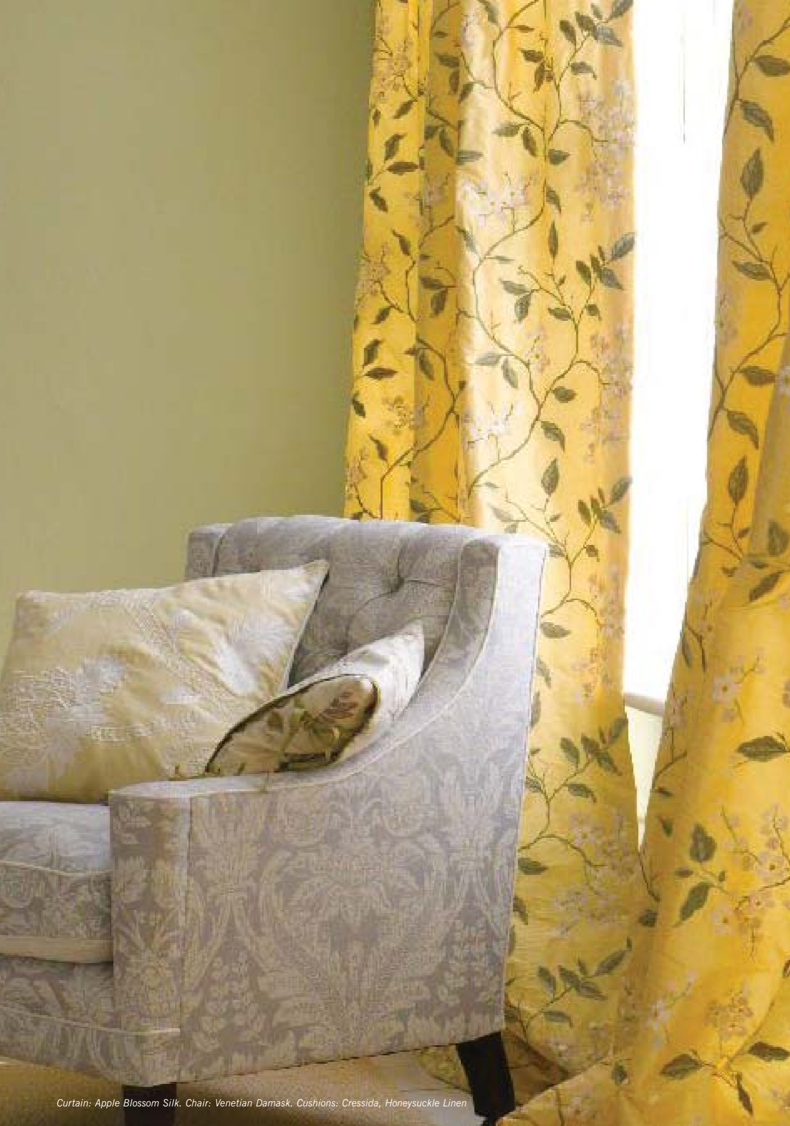
Curtain: Apple Blossom Silk. Chair: Venetian Damask. Cushions: Cressida, Honeysuckle Linen