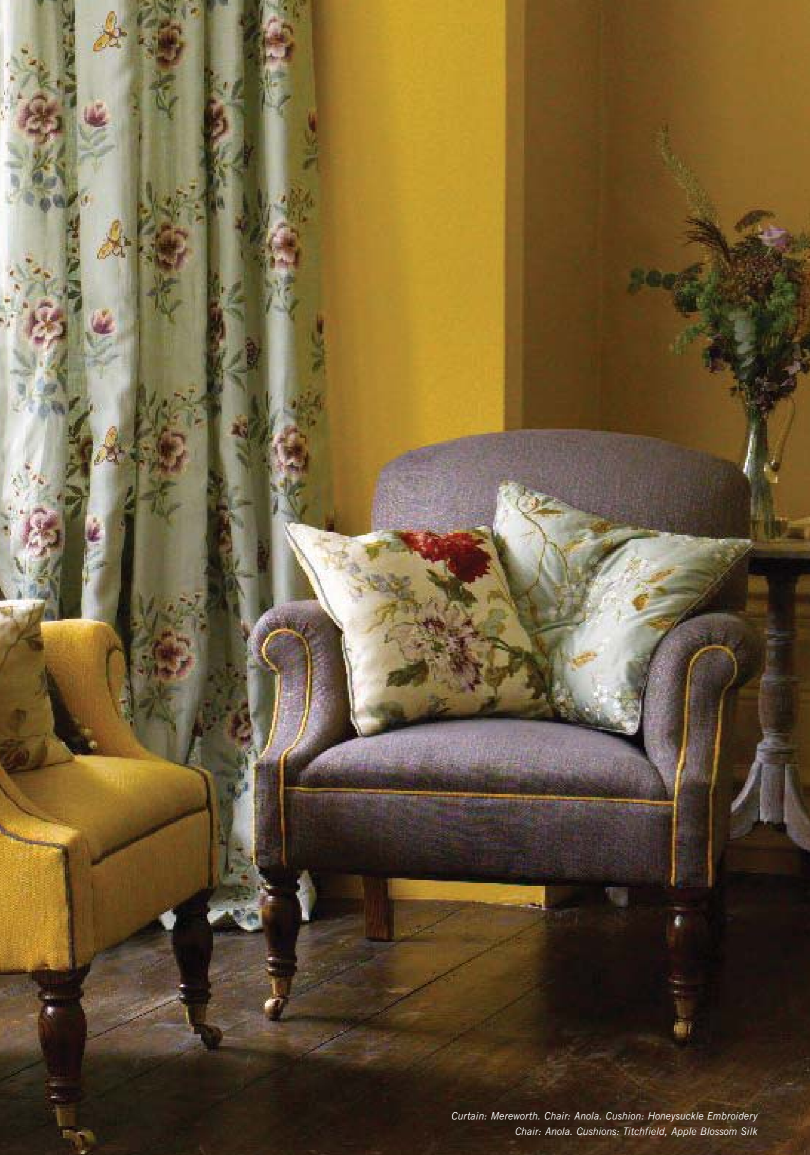
Curtain: Mereworth. Chair: Anola. Cushion: Honeysuckle Embroidery Chair: Anola. Cushions: Titchfield, Apple Blossom Silk