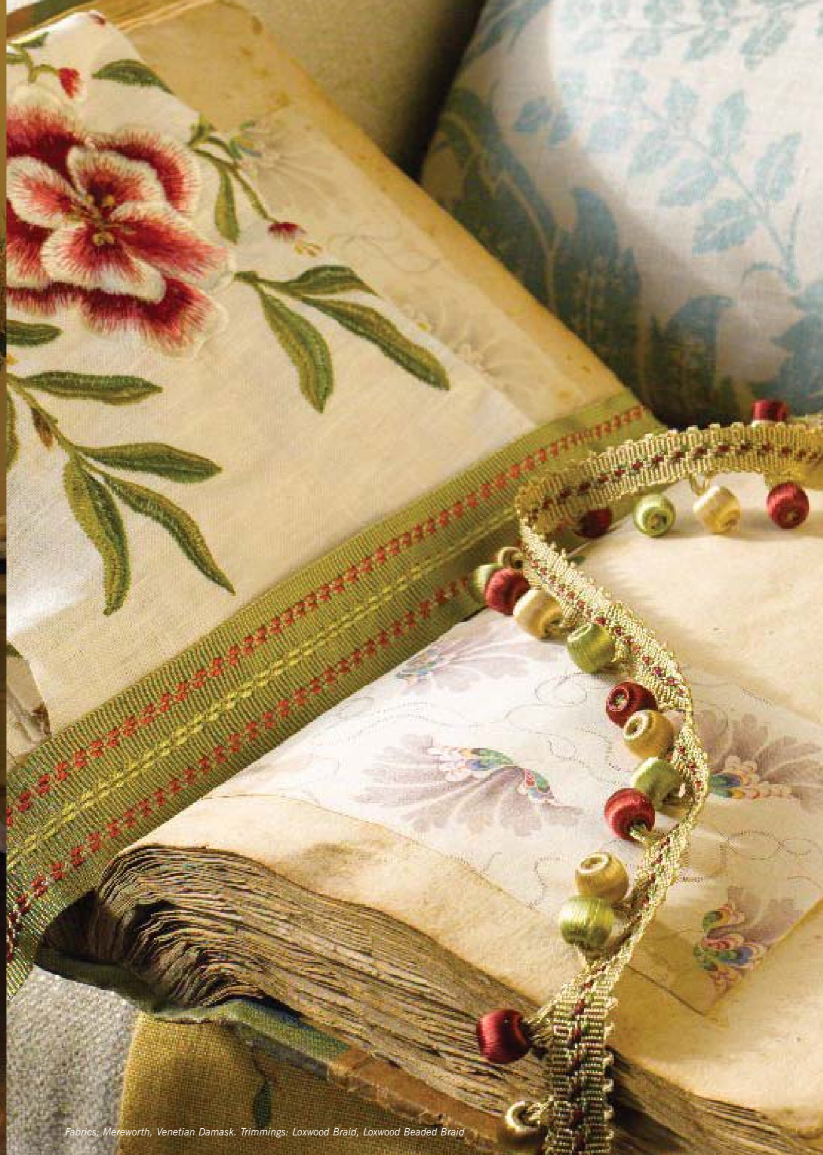
Fabrics: Mereworth, Venetian Damask. Trimmings: Loxwood Braid, Loxwood Beaded Braid