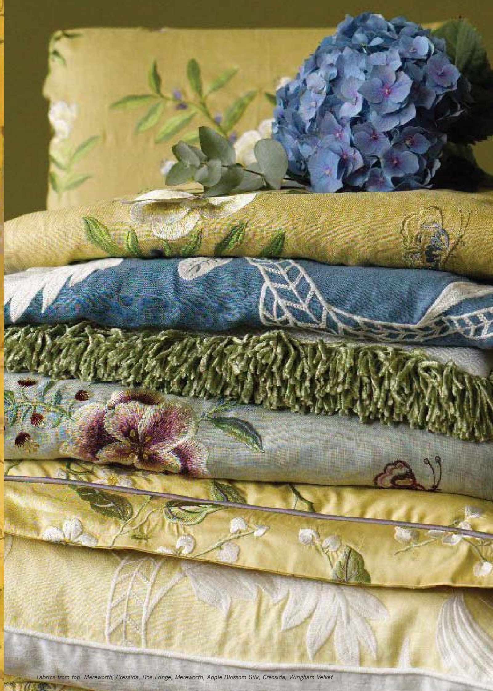
Fabrics from top: Mereworth, Cressida, Boa Fringe, Mereworth, Apple Blossom Silk, Cressida, Wingham Velvet