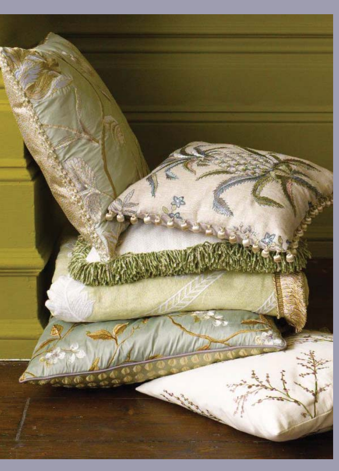
Front cover: Chair: Anola. Throw: Tulip Tree Linen, Ribbon Tassel Fringe. Cushions: Wingham, Loxwood Beaded Braid, Ribbon Loop Fring Above left: Chair: Anola. Cushion: Exotic Pineapple. Throw: Exotic Pineapple. Cressida, Loxwood Cut Fringe Above Right: Cushions: Tulip Tree Silk, Loxwood Beads, Apple Blossom Silk, Hopwood