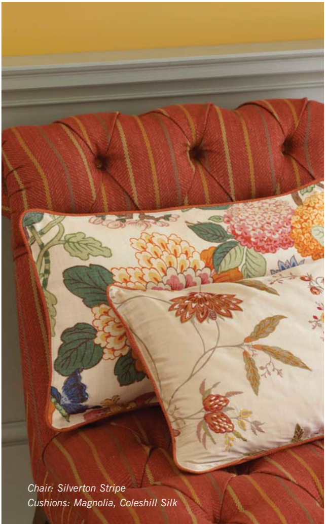
Chair: Silverton Stripe Cushions: Magnolia, Coleshill Silk