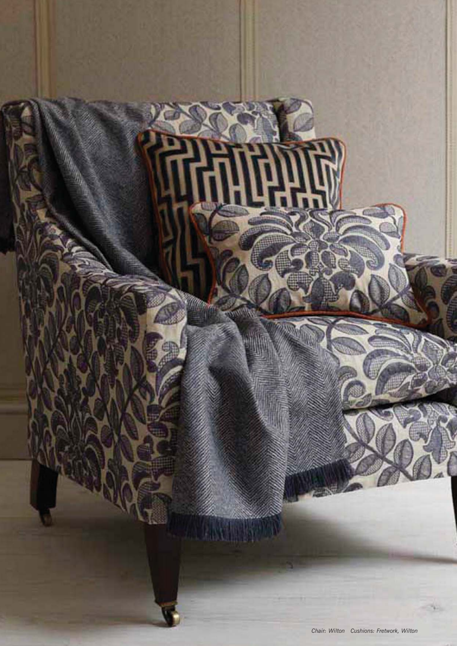
Chair: Wilton Cushions: Fretwork, Wilton