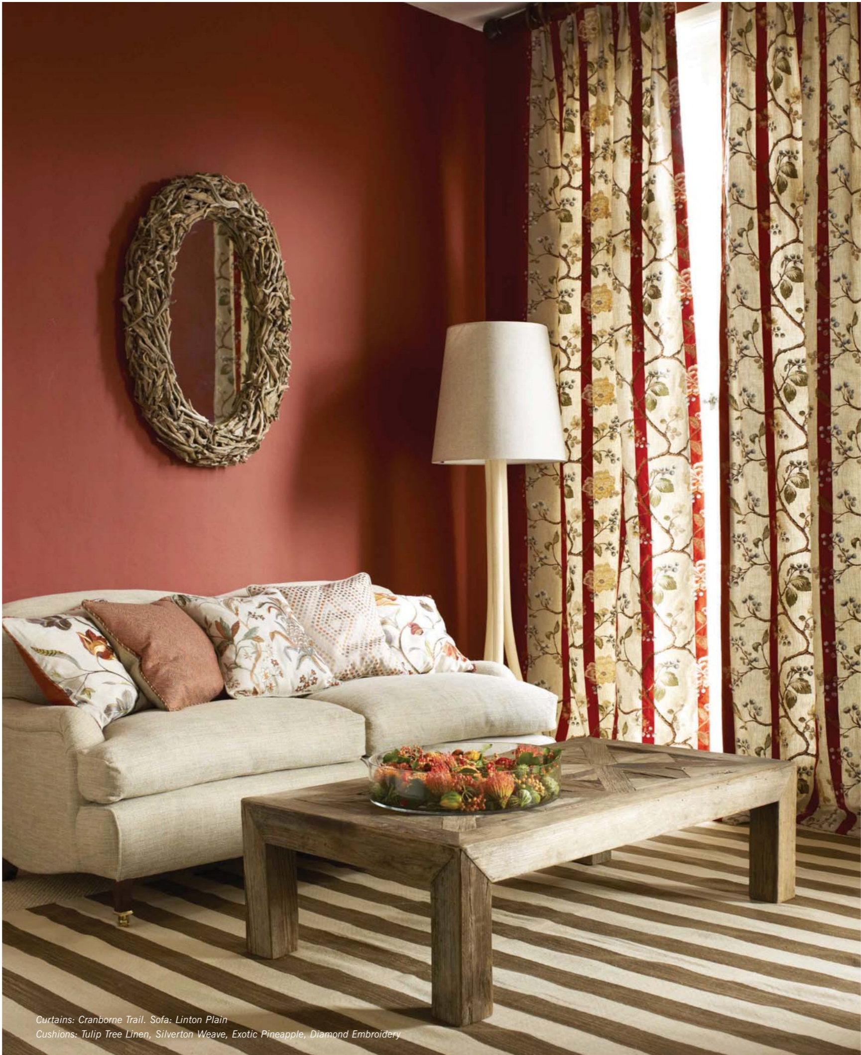
Curtains: Cranborne Trail. Sofa: Linton Plain Cushions: Tulip Tree Linen, Silverton Weave, Exotic Pineapple, Diamond Embroidery