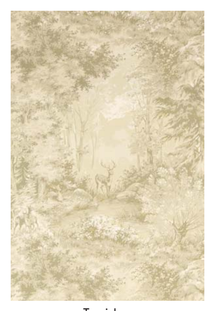
Torridon FG076/N102 4 colours