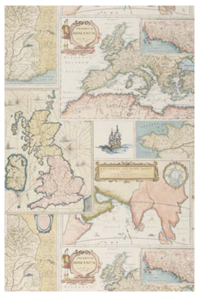
Bohemian Travels FG078/Y101 4 colours