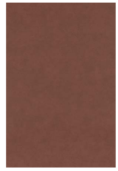
Vintage Leather FG075/G3 5 colours