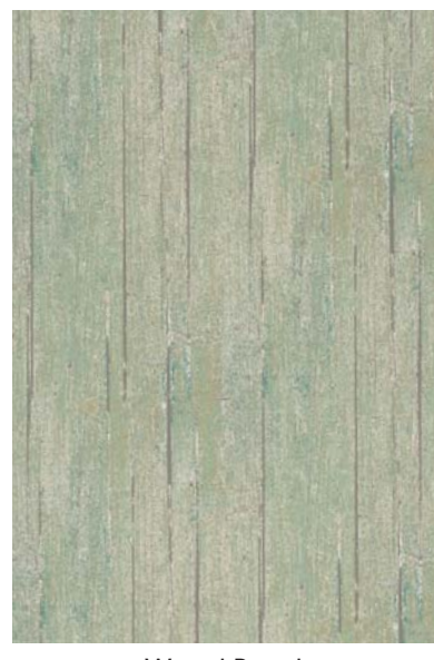
Wood Panel FG081/S23 4 colours