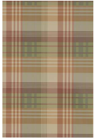
Mulberry Ancient Tartan FG079/Y107 4 colours