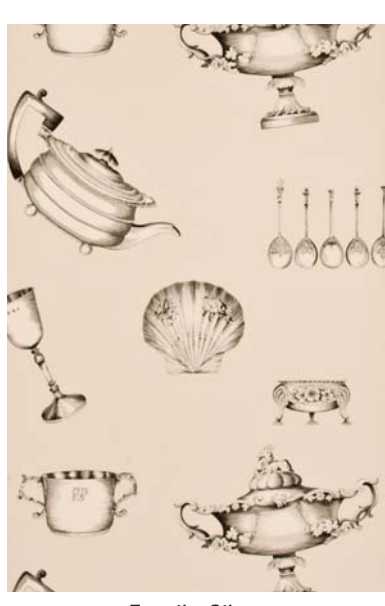
Family Silver FG058/A117 2 colours