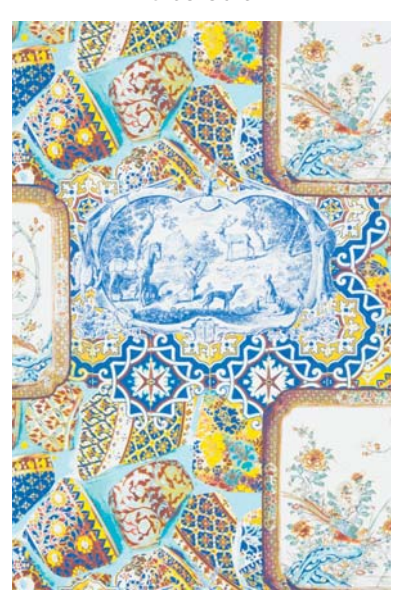
Mulberry China FG080/Y101 4 colours