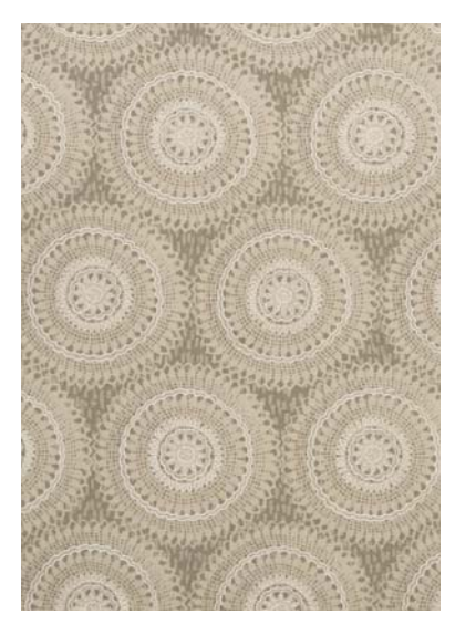
Cheriton BP10568/4 4 colours