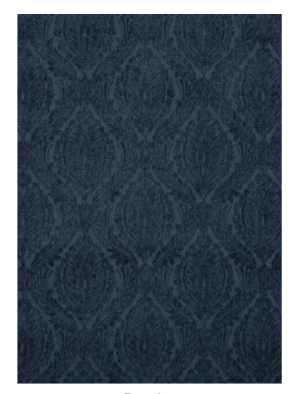
Pentire BF10569/680 5 colours