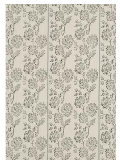
Zennor BP10555/3 4 colours