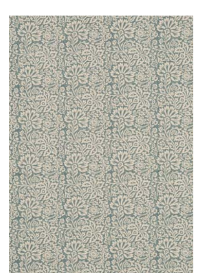
Flora BP10558/2 4 colours