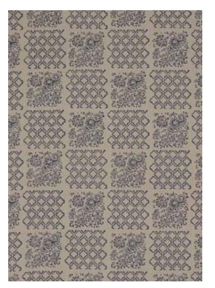
Carew BP10559/1 2 colours