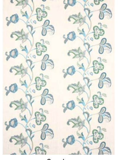
Cawdor BF10560/2 3 colours